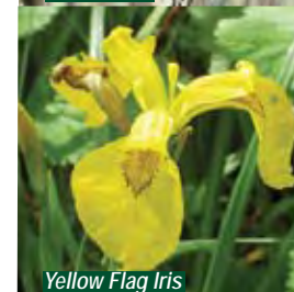
Yellow Flag Iris