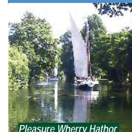
Pleasure Wherry Hathor

Other days of the week: There is a train a day at Berney Arms (two May-Sept.) Monday-Saturdays and one at Buckenham Saturdays; see the full timetable.