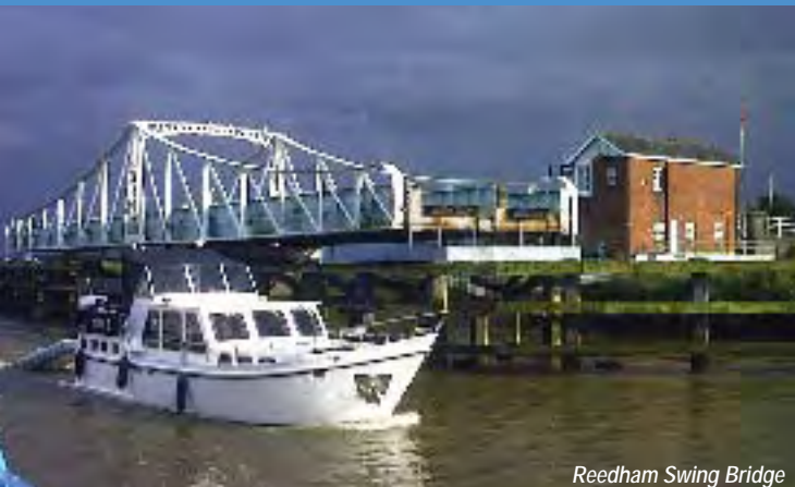
Reedham Swing Bridge

RSPB Strumpshaw Fen, Buckenham & Cantley Marshes: 01603 715 191, www.rspb.org.uk .